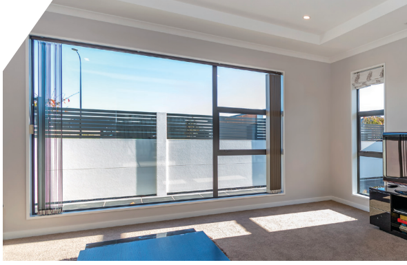
Fixed Pane with Awning Windows