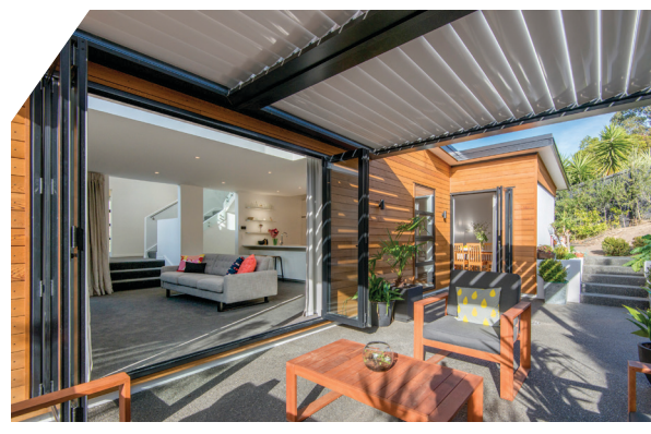
Bifold Door - 2-2 Configuration