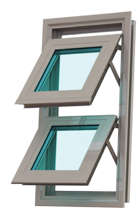
Seeway™ Frameless Sash Windows