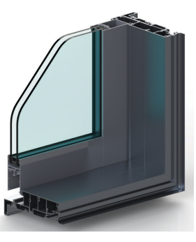
Eurostacker ™ Door

*2.4m high is recommended. Larger sizes may be possible, please contact your local fabricator for advice