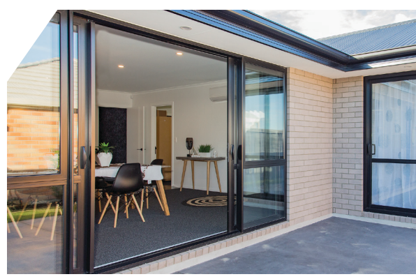
Biparting Ranchslider **